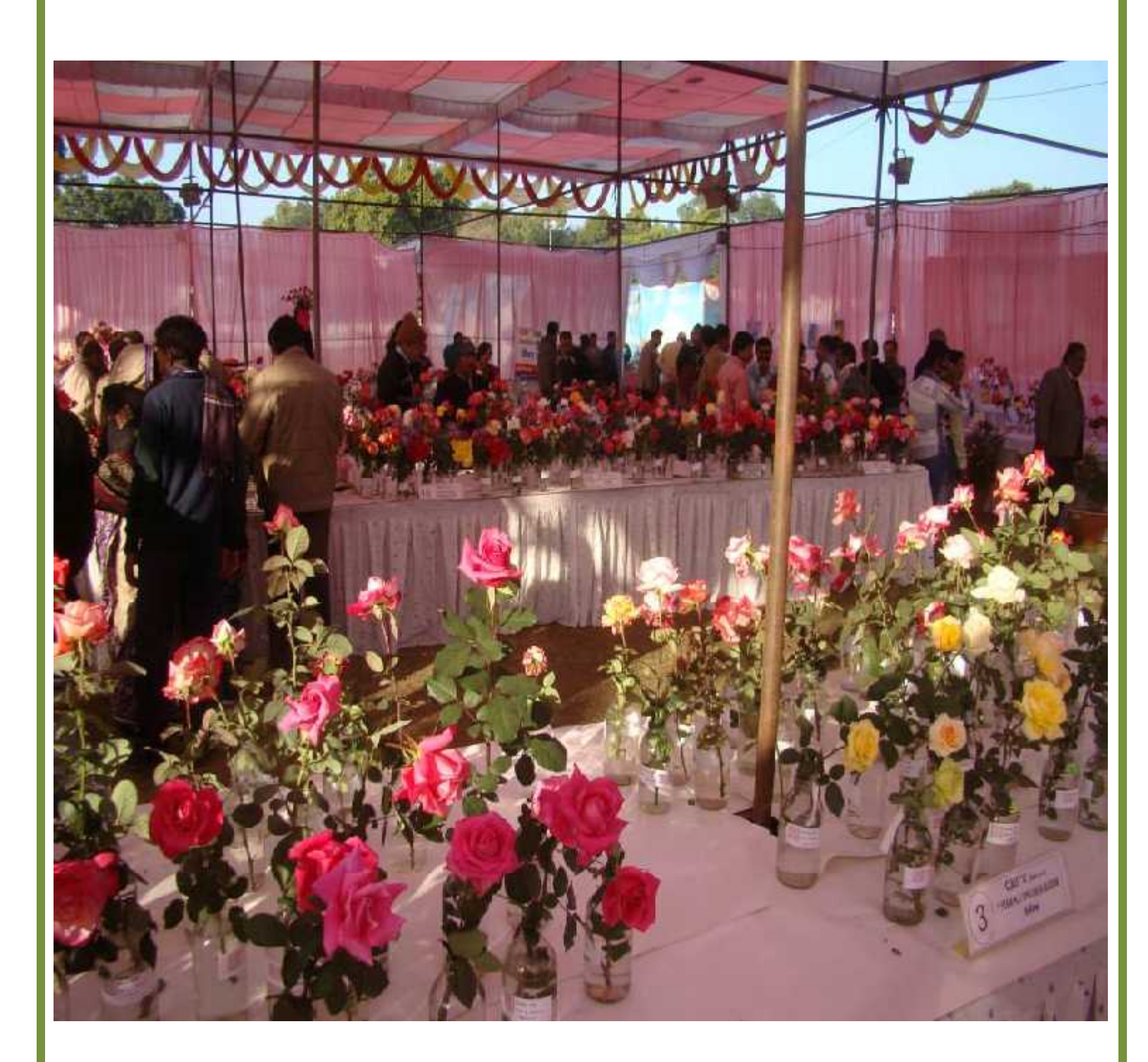
A glimpse of the exhibition hall

Images of Jabalpur Rose Show held on 17^{\rm th} & 18^{\rm th} of January - 2015. The Rose Society of Jabalpur.