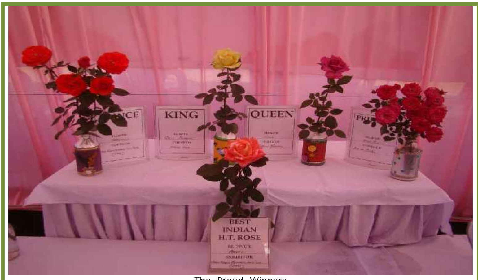
The Proud Winners