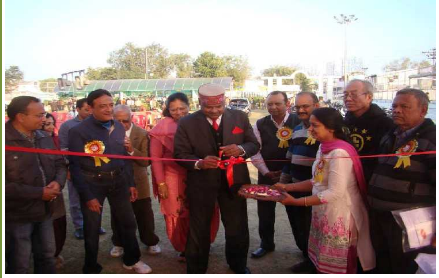
Brigadier Mathur inaugurating the show