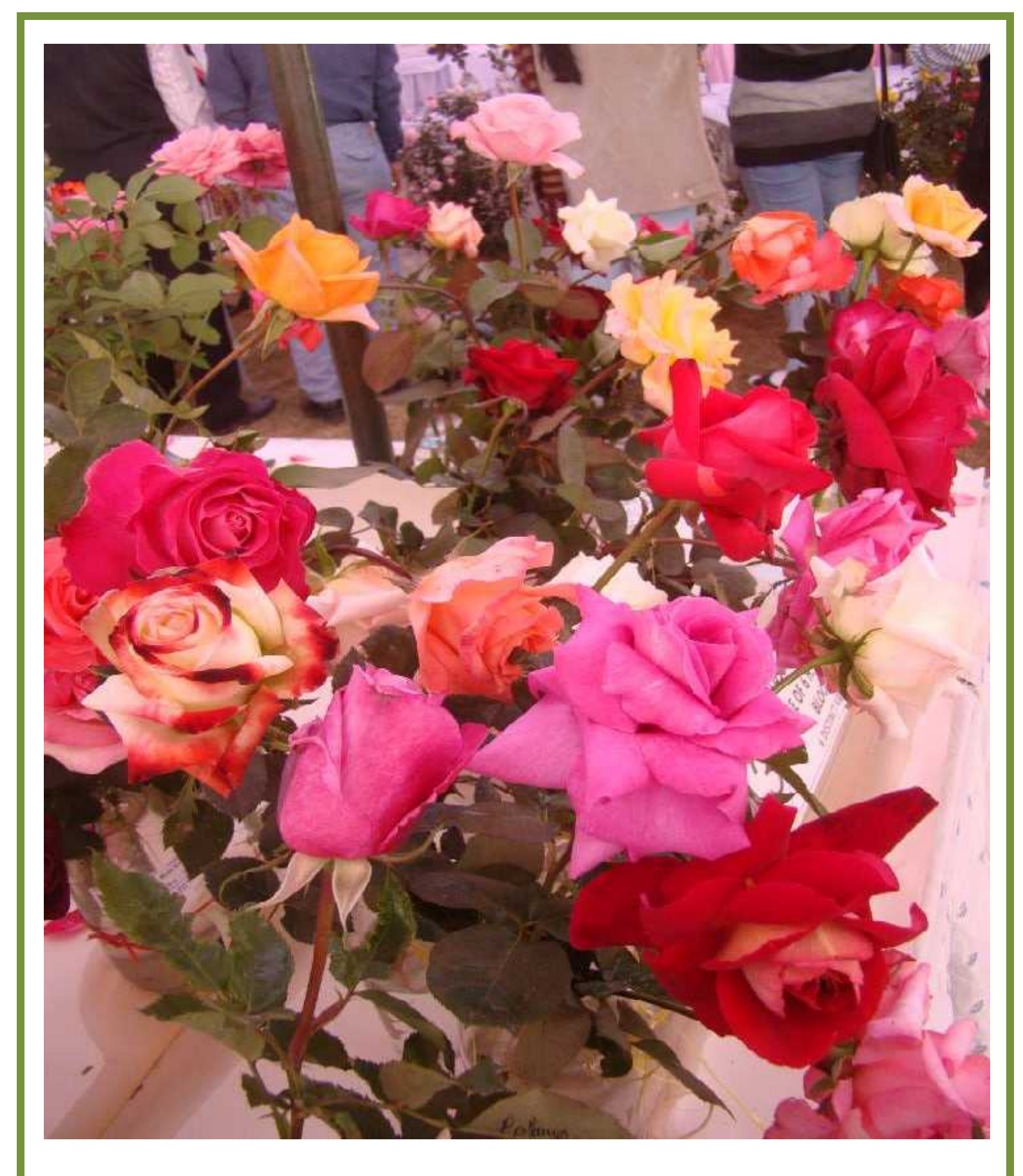
Cut Roses at a glance