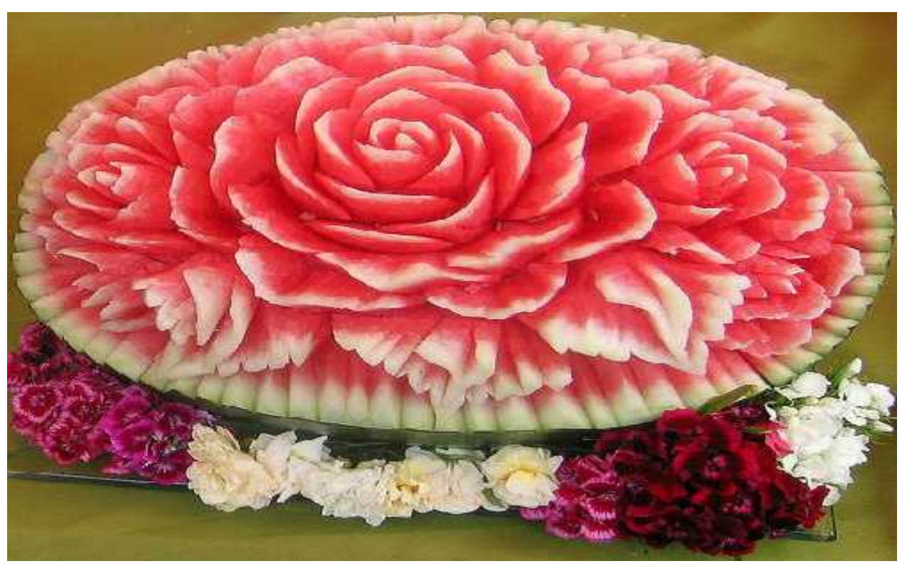
Rangoli with flowers and fruit carving