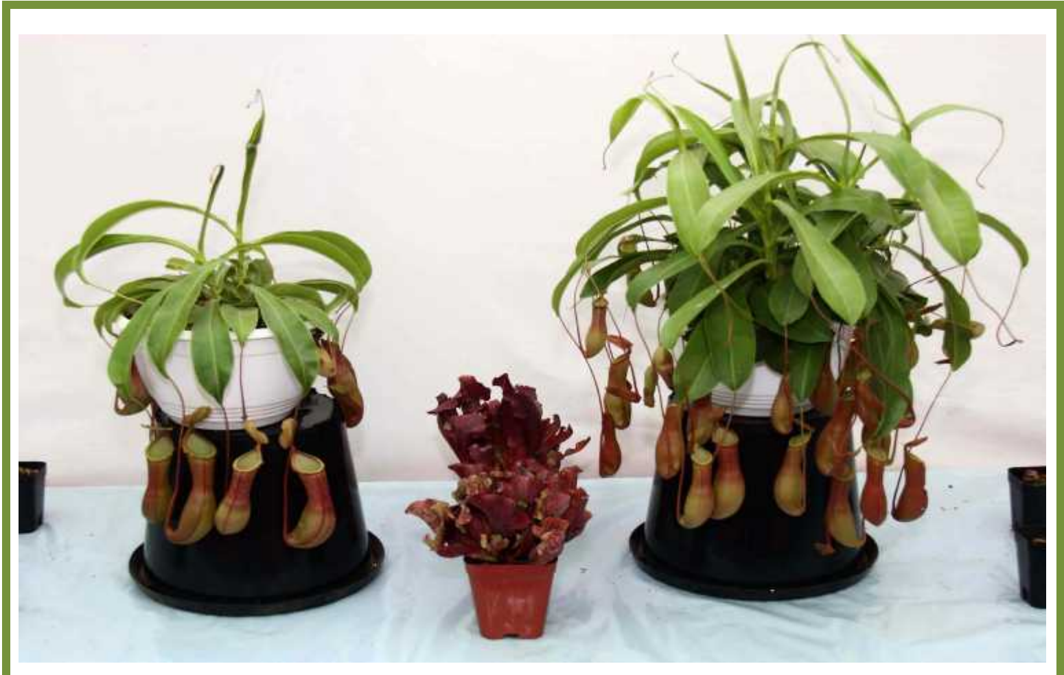
The Carnivorous plants on Display