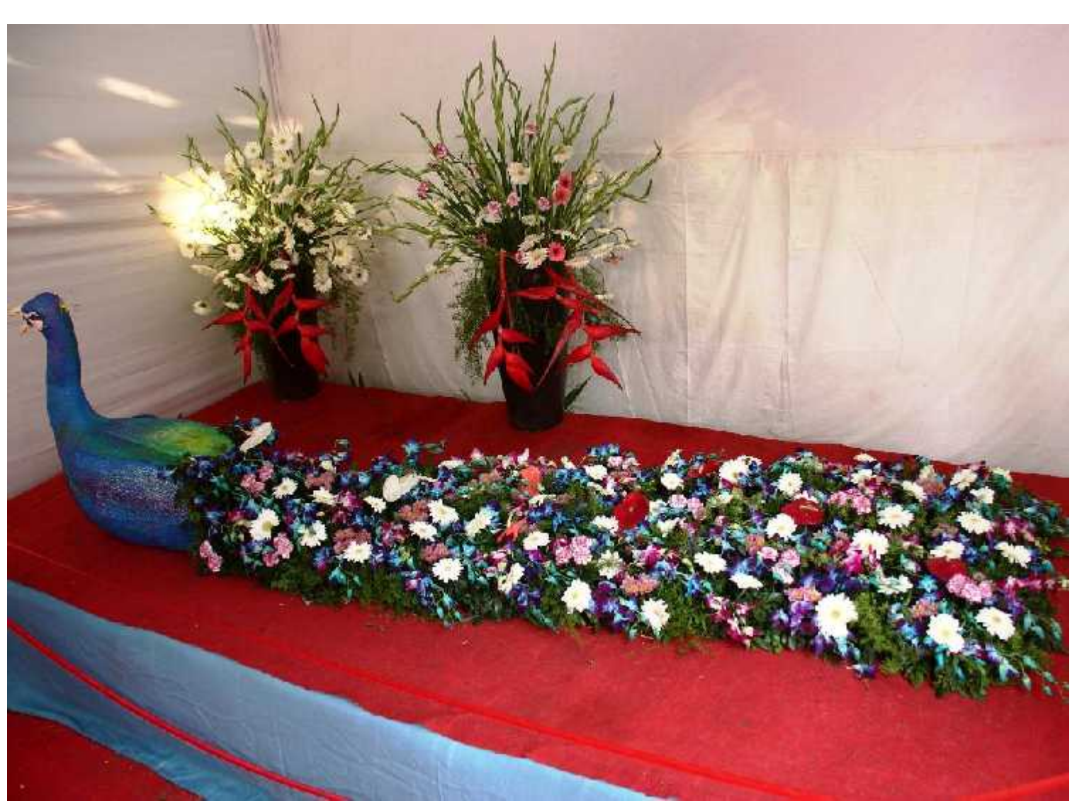
Peacock greets the visitors at the entrance made with flora below MIAL Logo