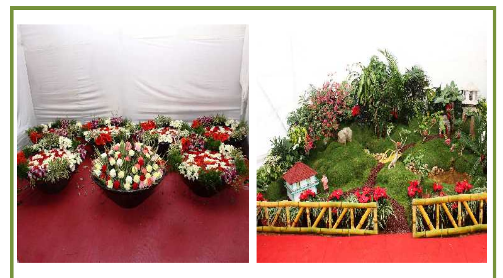
Flora on display, spot Landscaping by L & T Limited