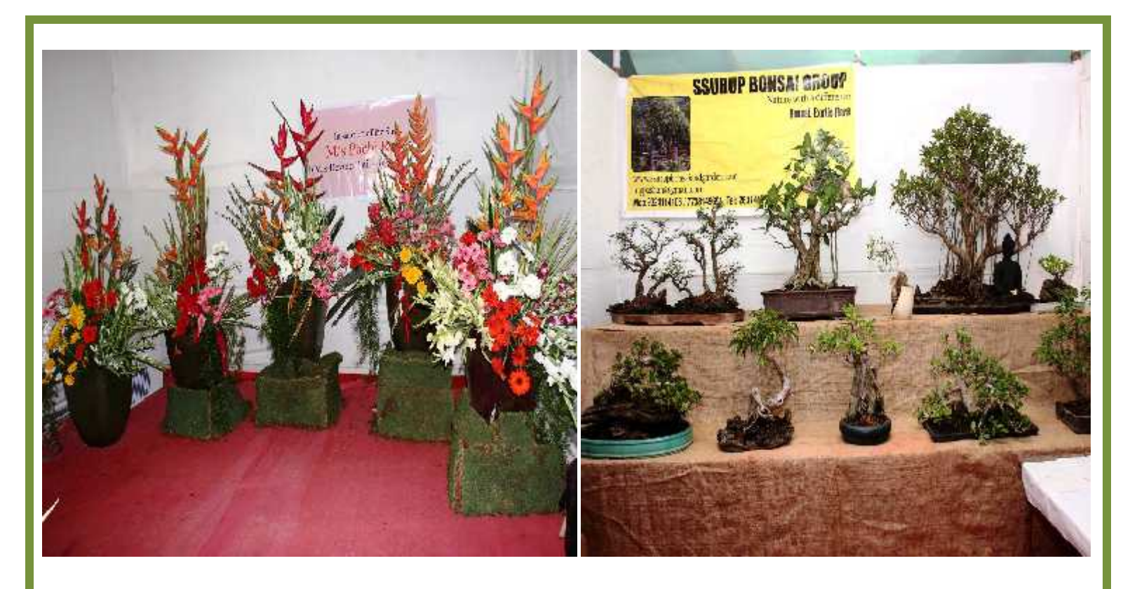
Pachu's display of Helliconia's and Bonsai's from Ssurup.