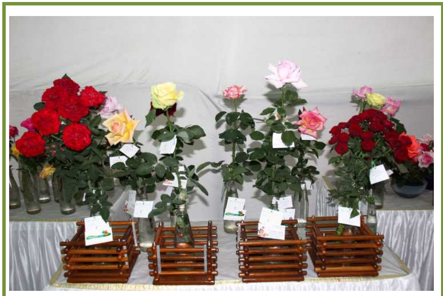
The proud Winners, King, Queen, Prince, Princess and Color Category.