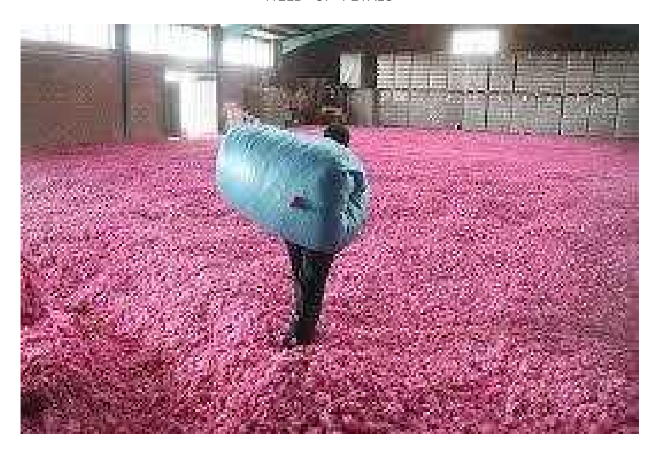
THE DISTILLATION PLANT