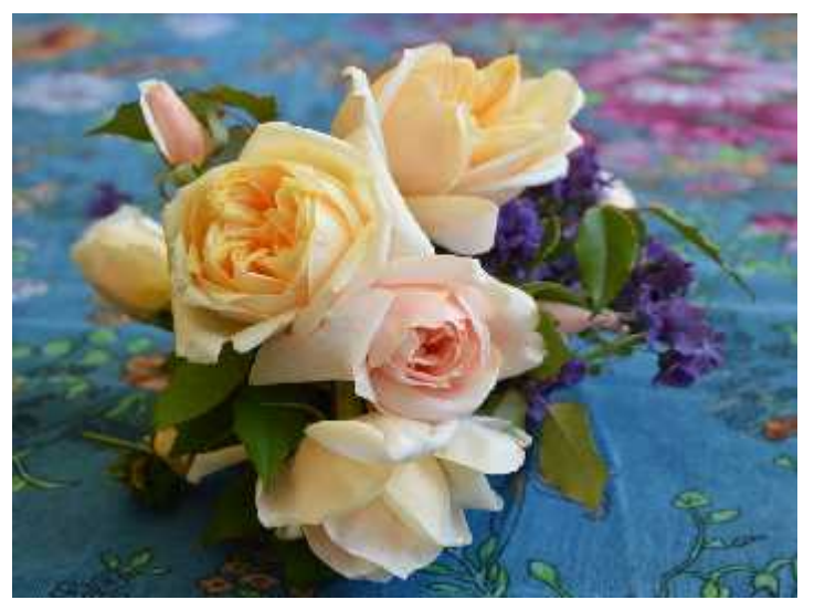
Our gigantea climber MANIPUR MAGIC

Aussie Sixer (Safrano x Manipur Magic) a tea rose Reve d'or x Aussie Sixer – a new seedling Photo Courtesy Billy West.