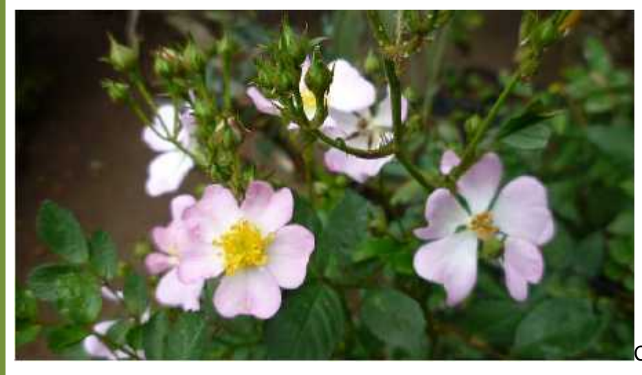
Chulalongkorn Hybrid Perpet