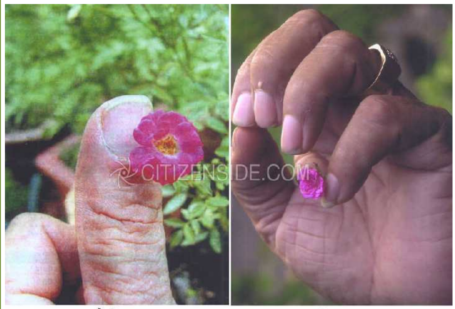
मोती गुलाब आकार 2.5 सेंटीमीटर (सितम्बर 04)

The letter from embassy reads that the breed will be displayed at a place that stands out in the exhibition area. "We plan to display diamond rose from India along with Rafflesia from Indonesia, Silverwords from USA, Giant Rose from Colombia