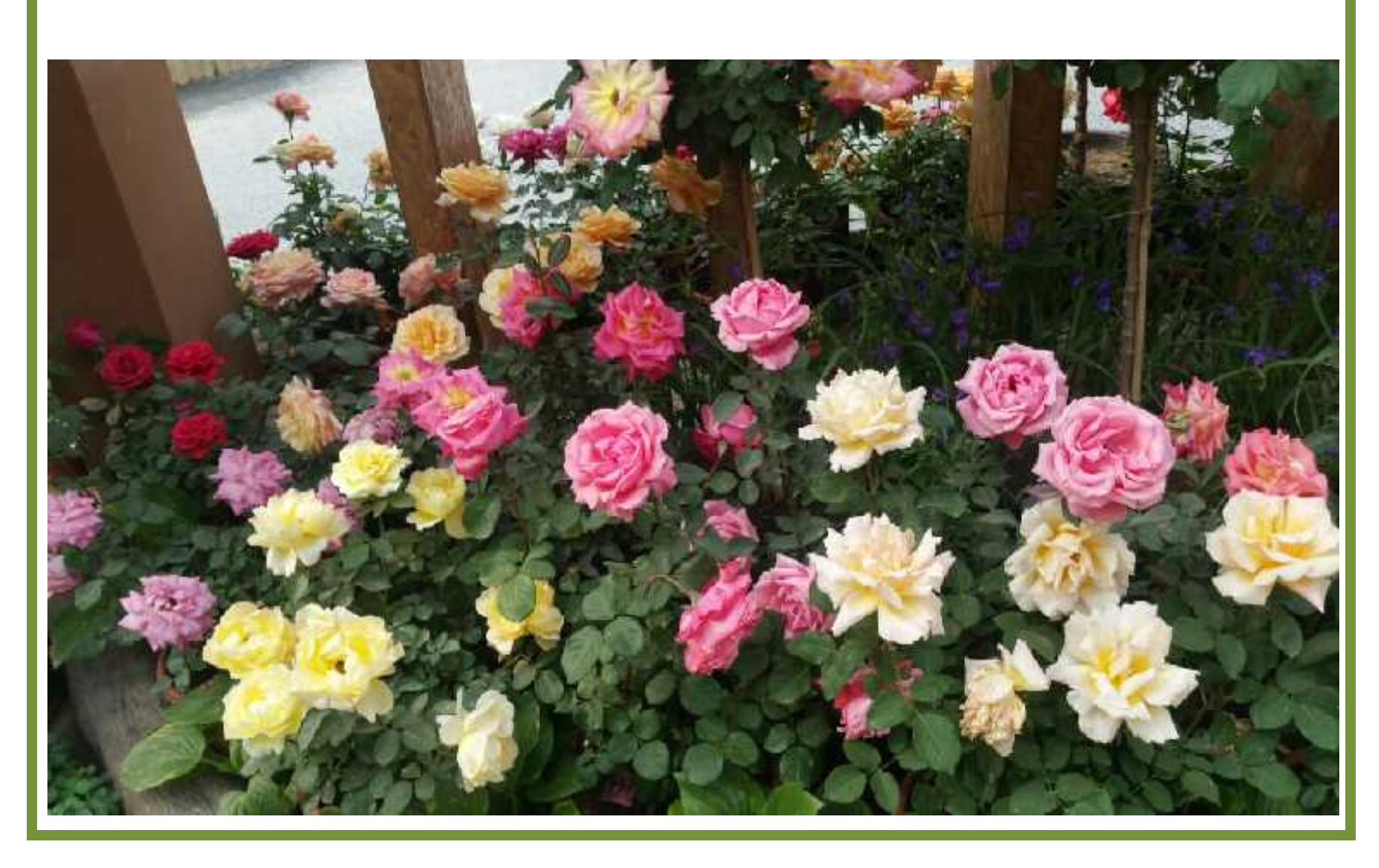
Some photos of displays at Beijing

She was one of the pioneers for rose breeding in China. More than 20 new varieties had been released and applied to all over the country, and 8 of them obtained the Authorized Certificate as new varieties in Beijing. She was also dedicated to tissue culture and propagation techniques the commercial flowers in China, and won the Second Class Prize of the National Scientific Technological Progress Award in 2007. More than 50 scientific articles were published in international and Chinese journals during the decades.