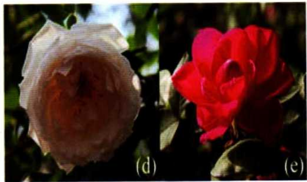
Fig.2 New rose cultivars named Rosa 'Tianshan' series (a) 'Tianxiang'; (b) 'Tianshanbaixüe'; (c) 'Tianshantaoyuan'; (d) 'Tianshanzhixing' 'Tianshanzhixing'