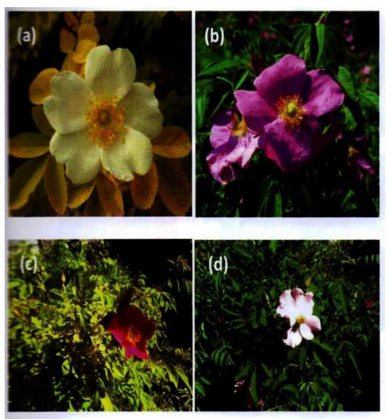
Fig.1 New rose cultivars named Rosa 'Tianshan' series (a) R. beggeriana'Aurea'; (b) R. davurica; (c) and (d) some of F1 progenies.