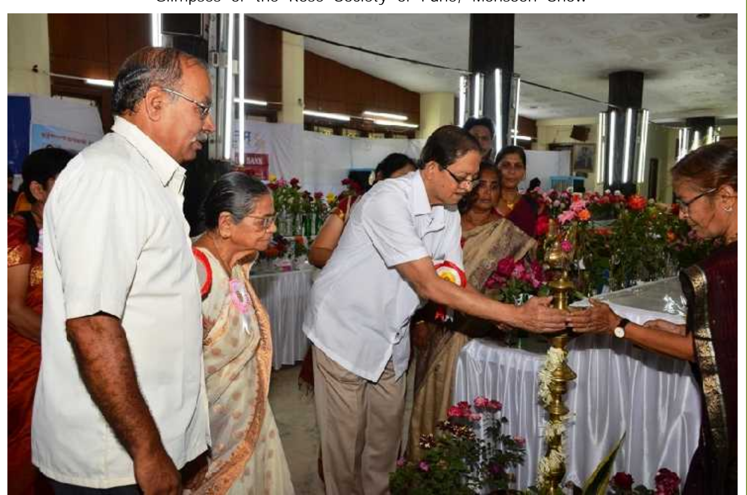
Glimpses of the Rose Society of Pune, Monsoon Show